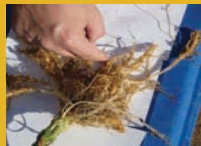
Treated Cucumber Plants