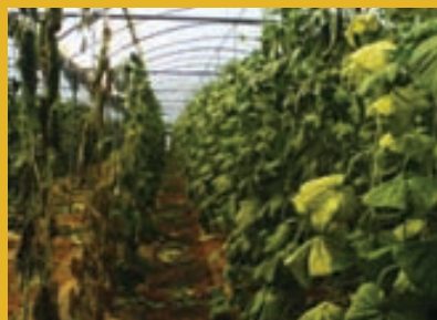
Untreated Cucumber Plants