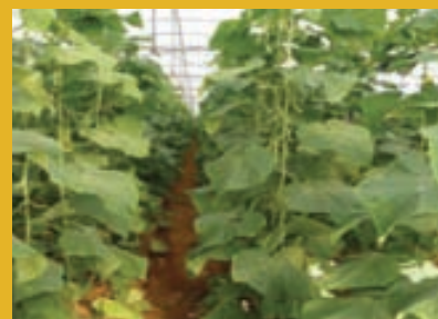
Treated Cucumber Plants