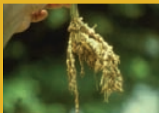
Untreated Tomato Plants