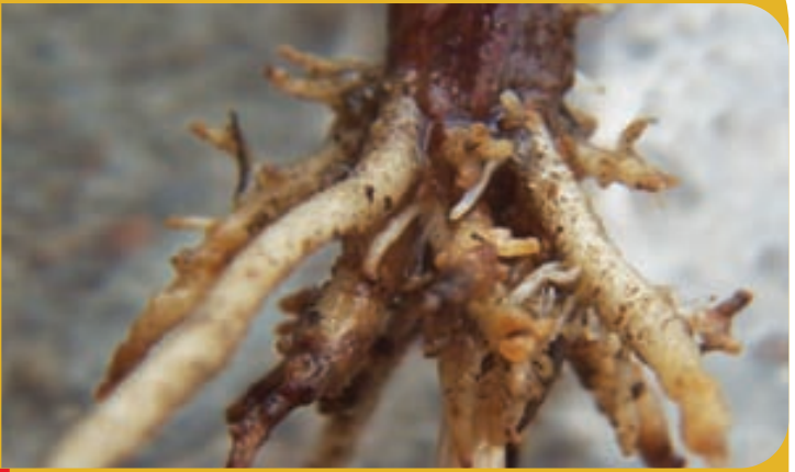
Nematode affected corn roots