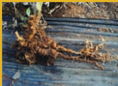
Untreated Cucumber Plants