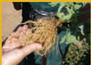
Treated Tomato Plants