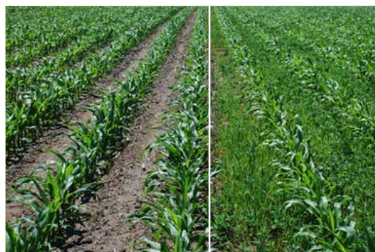
Field Treated with Spencer 260 OD™