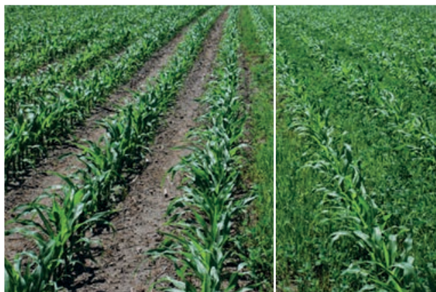
Field Treated with Spencer 260 OD™